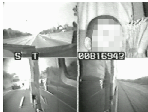
Figure 1. Four camera views as shown after being synchronized through a quad-splitter

Four cameras were installed on the trucks. These four cameras recorded drivers' faces, the forward view, the left side rear-view, and the passenger side rear-view. The four views were recorded simultaneously through a quad-splitter so that trained data analysts could view all four images simultaneously (Figure 1).