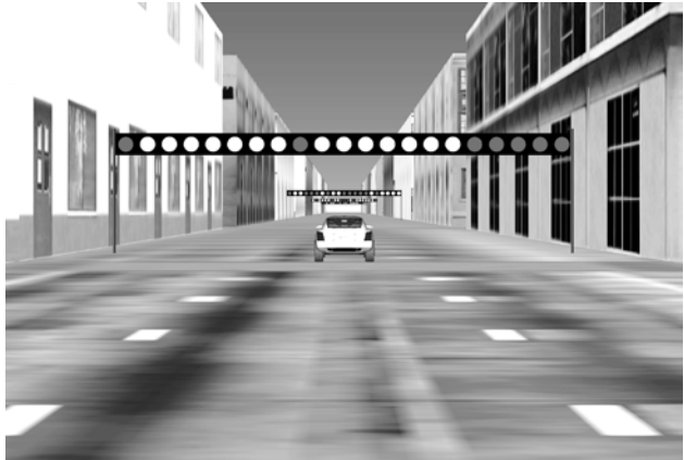
Figure 1. An example driving scene