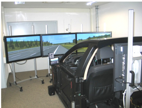
Figure 1. Simulator Setup

The study was conducted in BMW Group laboratories in Germany and China. The static driving simulator had six visual channels including rear visibility (see Figure 1). The three forward channel Plasma monitors, each at a resolution of 1920 × 1080 and with 127 cm screen size, were rendered at 60 frames/s and provided a horizontal field of view of 78°. A display with the same specifications right behind the vehicle's rear seats provided an image for the rearview mirror. The two side mirror rear channels accommodated 800x600 TFT displays.