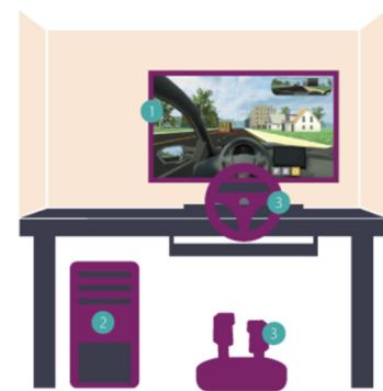
Figure 1. Workstation Setup: 1) standard monitor, 2) standard computer, 3) off-the-shelf USB steering wheel & pedals.

Workflow. OBMV staff invited driver license applicants arriving at test centers to volunteer to complete the VDT immediately before their pre-scheduled ORE. The VDT workflow lasted 15 minutes, and included an orientation video, acclimation drive, a brief instructions test, and finally the assessment drive (see Walshe et al., 2018). Applicants completed one of ten randomly assigned assessment course variants, all of which incorporated common, serious crash scenarios (McDonald et al, 2012; USDOT, 2008). These scenarios included: rear-end events (lead car brakes suddenly); intersections (between 8-13 with instructions to turn left, right, or continue straight at three- and four-way stop signs and traffic lights); curved roads; merges; and hazard zones (construction zones, crosswalks, etc.). In order to best reflect the local driving environment, these driving scenarios also included varied setting (urban and suburban) and on-road elements (school buses, pedestrians, etc.). These courses, designed with Ohio subject matter experts, are proprietary to Diagnostic Driving Inc. and the State and are currently an active part of the licensing workflow: thus we cannot describe the drives in greater detail. After the assessment, applicants completed a three-item feedback survey using a 5 point Likert response scale (see Walshe et al., 2018).