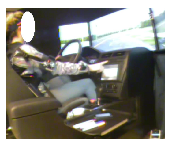
Figure 1. Experiment Setup. The figure shows the participant is using the navigation panel while driving on highway scenario with right wrist kinematics tracked by an IMU sensor