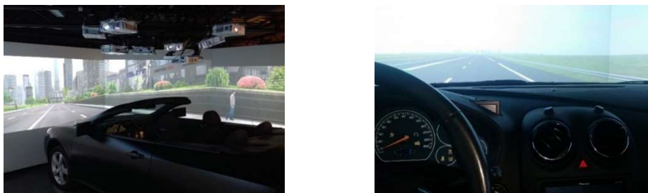
Figure 1. (Left) fixed base OKTAL driving simulator, (Right) dash-mounted buttons used when drivers had to indicate they were thinking of driving (left button) or off-task (right button)

A fixed base Oktal Driving Simulator was used for this experiment, which consisted of a Pontiac G6 car body surrounded by 300° of viewing screens (Figure 1). The vehicle is equipped with standard vehicle controls, all of which function as they would in an actual vehicle. Additionally, speakers and vibration transducers simulate the sounds and sensations experienced during acceleration, and force-feedback in the steering wheel simulates the feeling of steering a real car. Mounted on the dashboard (above the center console) were two response buttons, labelled “Yes” and “No” (Figure 1). When queried, participants were required to press one button if they were thinking of driving, and the other if they were not.