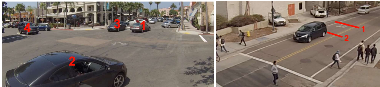
Figure 2. Advancing & Slowing Early Left, vehicles are labeled with red numbers indicating their turn taking order, showing cars advance into intersection, indicating they are ready for their turn, even before other cars are clear of intersection. All four cars were moving inside the intersection at the same time. Right, vehicle begins slowing at red line “1” and then more at line “2” and continues through without stopping.

When drivers did not stop significantly short of a crosswalk, pedestrians often demonstrated discomfort, showing stopping short is a social norm within the road user community. Figure 4 demonstrates such an interaction showing a pedestrian staring at a car that has stopped right at the crosswalk and changing his path slightly away from the car to the edge of the zebra crossing.