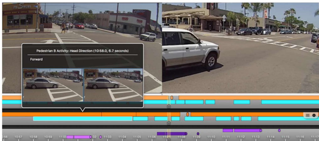
Figure 1. ChronoViz Session. Intersection includes side streets with stop signs and main roadway crosswalk with no stop sign, seen from two directions. Two pedestrians waited for SUV to pass before crossing. The timelines can be seen below the images. Within each of the top two timelines are two sets of annotations (top is movement, bottom is head position). The bottom timeline contains the movement annotations for three vehicles.

A variety of roadways and intersections were included in the study, each with a different roadway configuration, geometry and traffic control type, ranging from highly controlled four-way stops to completely uncontrolled middle of the street locations. Multiple cameras, either stationary or first person, recorded the environment from different perspectives. Stationary recordings were performed from locations adjacent to intersections. First person recordings used wearable or dashboard mounted cameras to record the point of view of pedestrians. Video feeds were synchronized and coded using ChronoViz, a software tool that aids visualization and analysis of multimodal time-coded data (Fouse, et. al., 2011). During the analysis, particular attention was paid to the way road users position their vehicles or their bodies with respect to road markings and traffic control devices such as stoplights and signs, and how they would change their behavior in the presence of other road users.